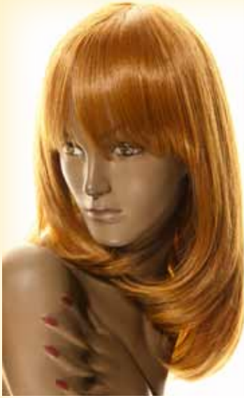
672100 Colour: 27

Futura Hair is the first heat resistant fibre that is also fire-retardant. Wash it, condition it and dry it like your own hair. Your Futura hairpiece is incredibly rich in variety. Change your appearance and look gorgeous without changing the extension. You can use hair-dryers, curling irons and flat irons.