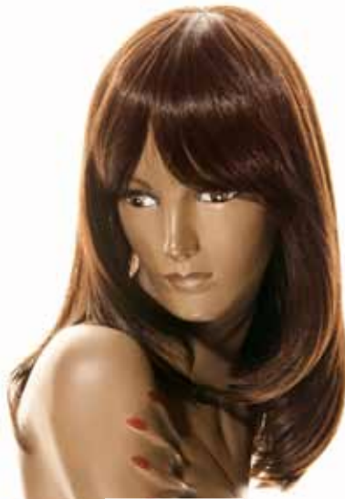
672140 Colour: FS4/30