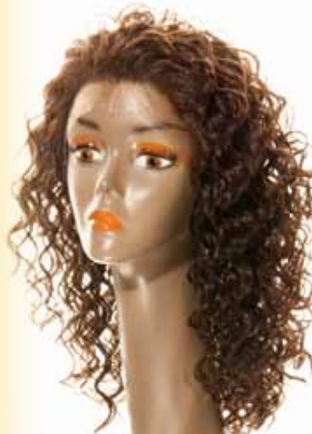
672880 Colour: 4