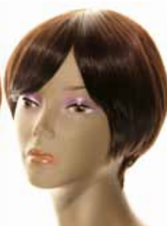
672200 Colour: 4