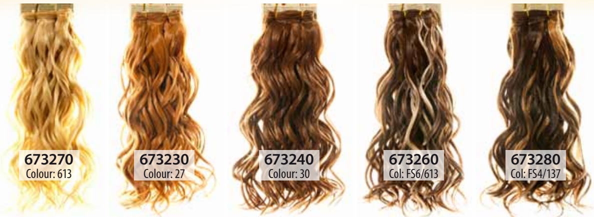
673270 Colour: 613