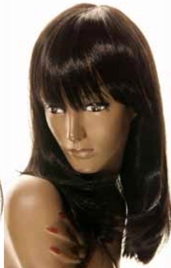
672060 Colour: 1B