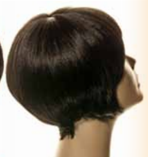
672170 Colour: 1