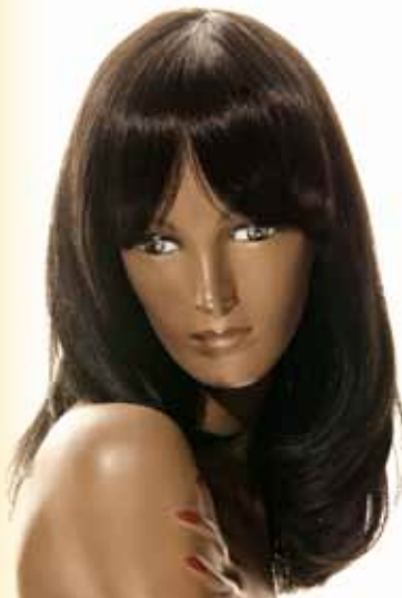
672050 Colour: 1