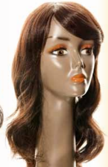
672310 Colour: 4