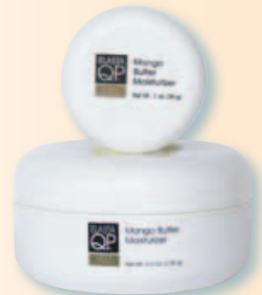
374040 Moisturizer 125 ml + 25 ml