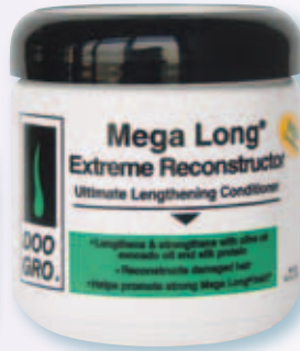
876020 Lengthening Hair Conditioner 450 ml