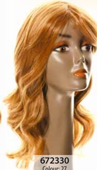
672330 Colour: 27