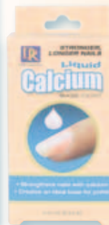
876160 Base Coat 15 ml