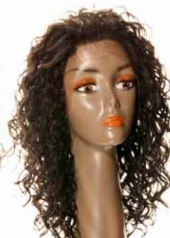
672860 Colour: 1B