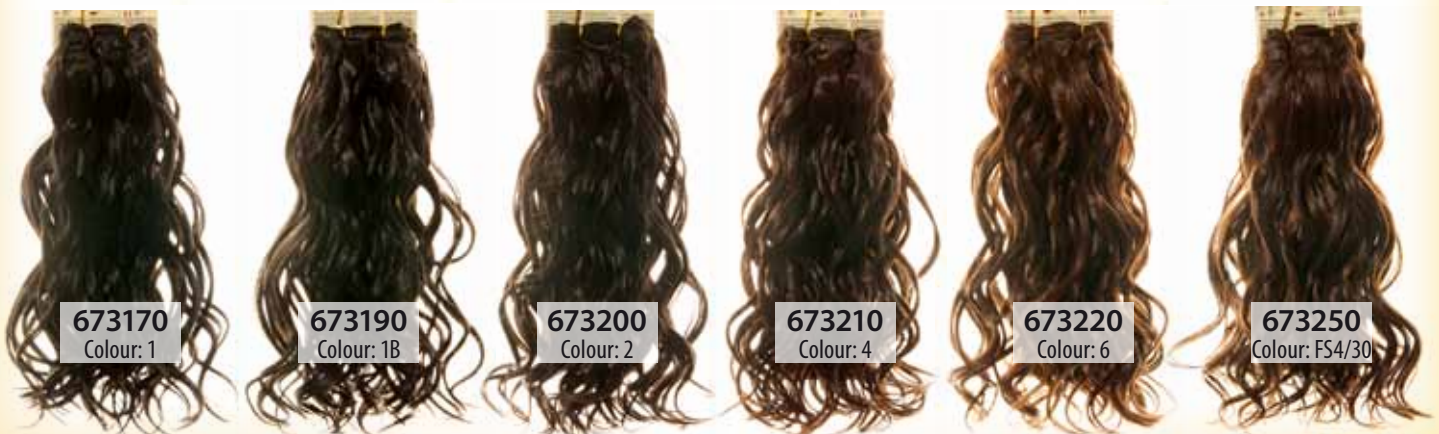
673170 Colour: 1