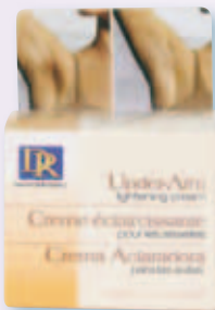
876110 Lightening cream 40 ml