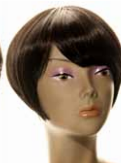
672180 Colour: 1B