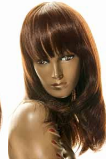
672090 Colour: 6