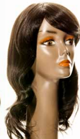
672290 Colour: 1B