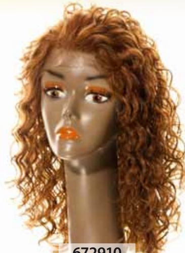
672910 Colour: 30