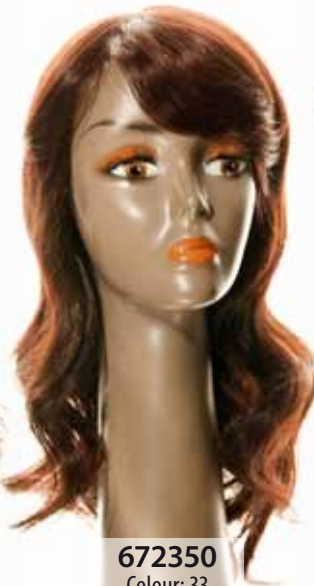
672350 Colour: 33