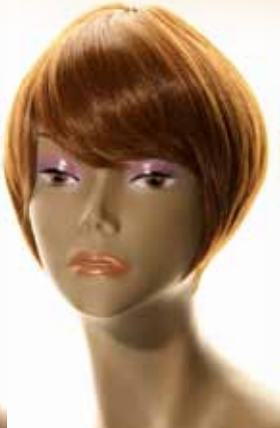
672230 Colour: 30