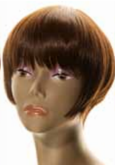
672210 Colour: 6