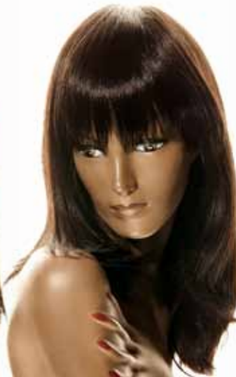
672070 Colour: 2