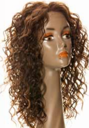
672920 Colour: FS4/30