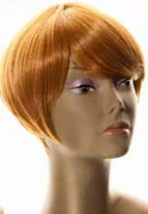
672220 Colour: 27