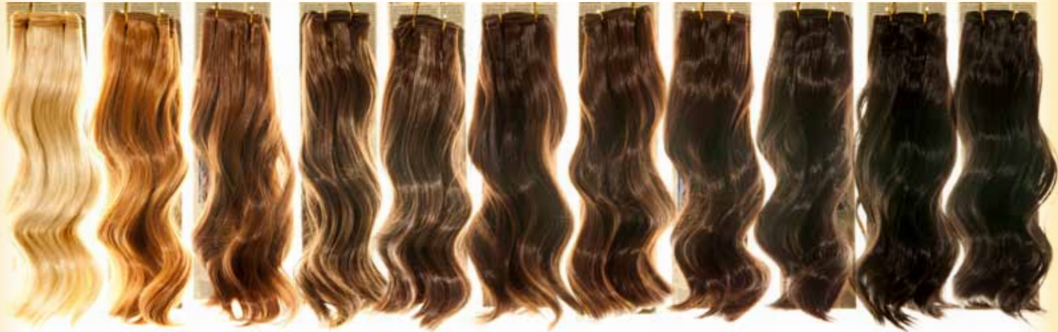
673160 Colour: 613