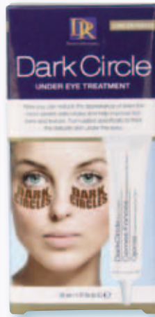
876170 Under Eye Treatment 30 ml