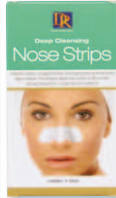
876140 Cleansing Strips 4 strips