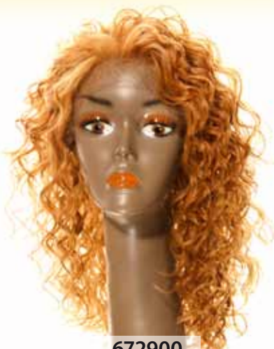
672900 Colour: 27