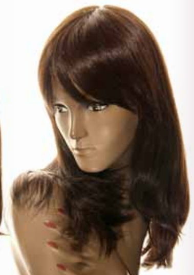
672080 Colour: 4