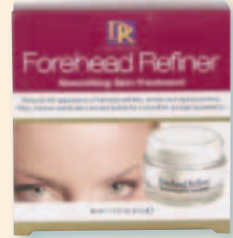
876030 Smoothing Skin Treatment 45 ml