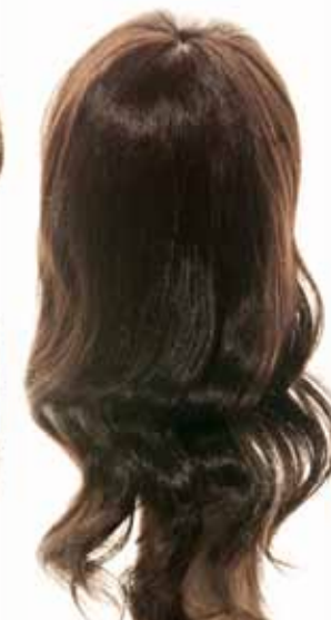
672300 Colour: 2