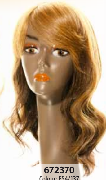
672370 Colour: FS4/137