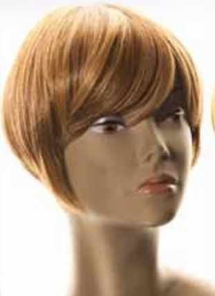
672250 Colour: D6/127