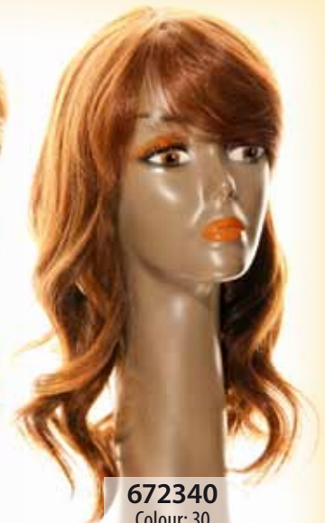
672340 Colour: 30