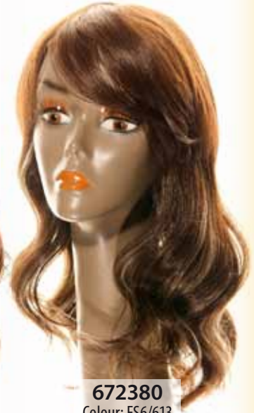
672380 Colour: FS6/613