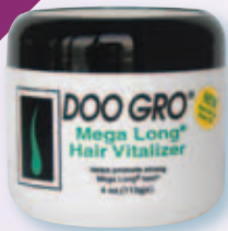
876010 Hair Vitalizer 110 ml