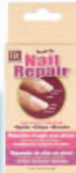
876150 Nail Repair 15 ml