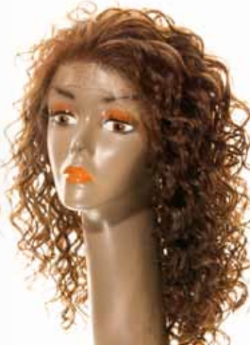
672890 Colour: 6