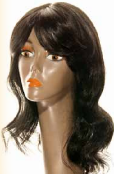
672280 Colour: 1