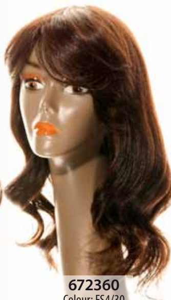
672360 Colour: FS4/30