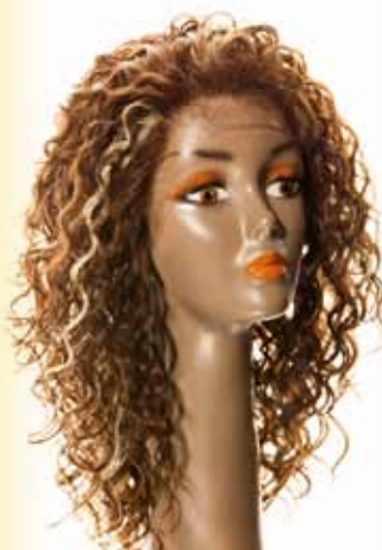
672940 Colour: FS6/613