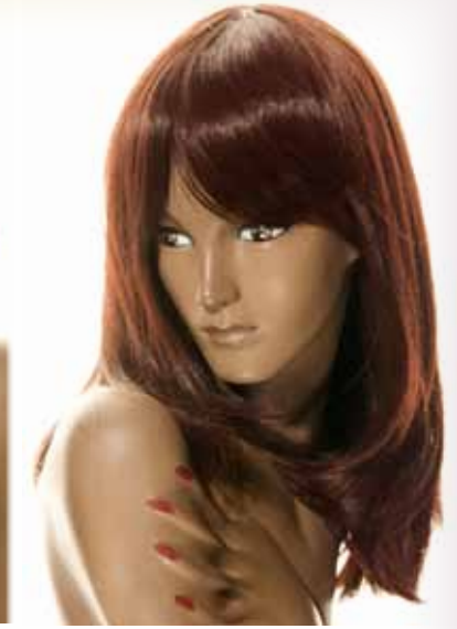
672120 Colour: 33