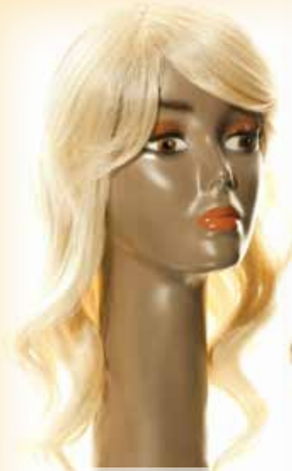
672390 Colour: 613

Futura Hair is the first heat resistant fibre that is also fire-retardant. Wash it, condition it and dry it like your own hair. Your Futura hairpiece is incredibly rich in variety. Change your appearance and look gorgeous without changing the extension. You can use hair-dryers, curling irons and flat irons.