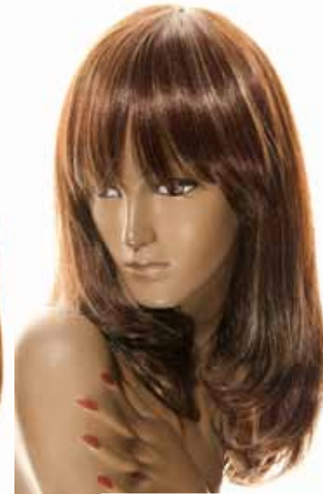
672160 Colour: FS6/613