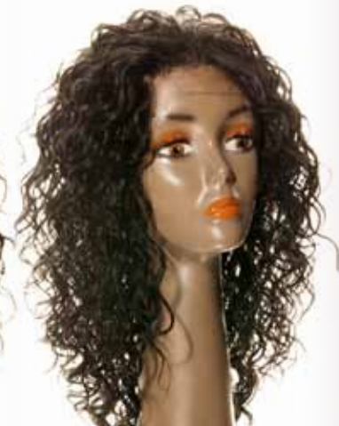
672850 Colour: 1