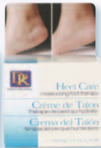
876130 Moisturizing foot therapy 40 ml