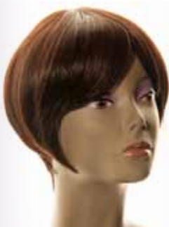
672240 Colour: FS4/30