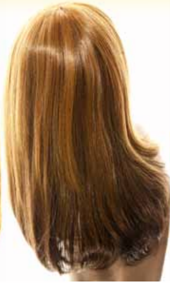
672150 Colour: FS4/137