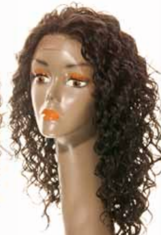
672870 Colour: 2