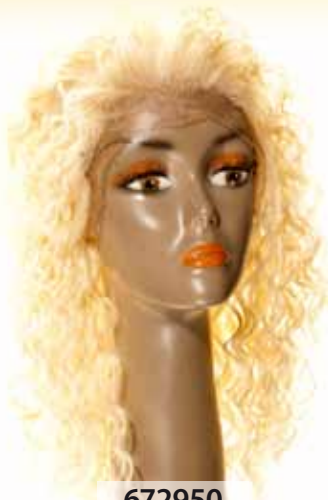
672950 Colour: 613

Futura Hair is the first heat resistant fibre that is also fire-retardant. Wash it, condition it and dry it like your own hair. Your Futura hairpiece is incredibly rich in variety. Change your appearance and look gorgeous without changing the extension. You can use hair-dryers, curling irons and flat irons.