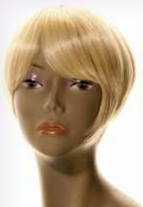
672260 Colour: 613

Futura Hair is the first heat resistant fibre that is also fireretardant. Wash it, condition it and dry it like your own hair. Your Futura hairpiece is incredibly rich in variety. Change your appearance and look gorgeous without changing the extension. You can use hair-dryers, curling irons and flat irons.