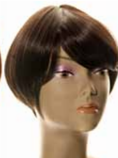
672190 Colour: 2