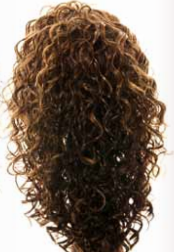
672930 Colour: FS4/137