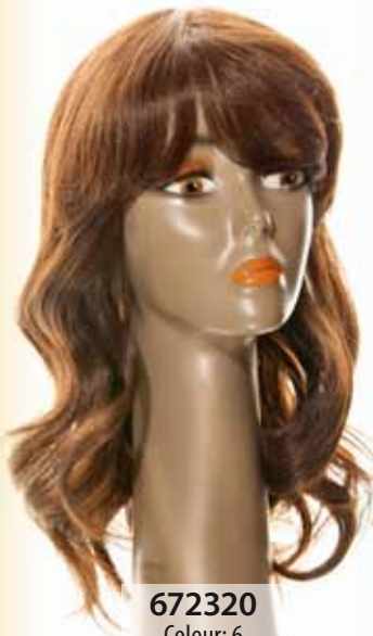
672320 Colour: 6