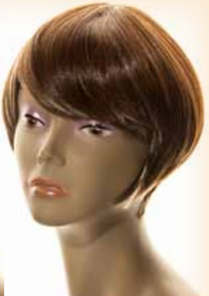
672270 Colour: FS6/613